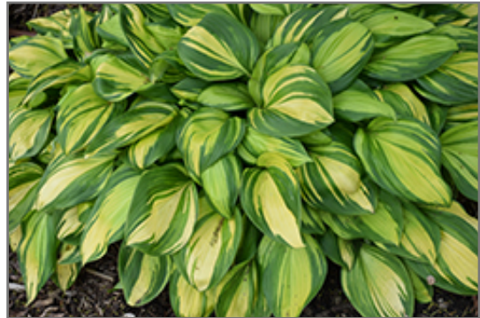
Rainbow's End Hosta

Rainbow's End Hosta will grow to be only 6 inches tall at maturity extending to 10 inches tall with the flowers, with a spread of 24 inches. When grown in masses or used as a bedding plant, individual plants should be spaced approximately 20 inches apart. Its foliage tends to remain low and dense right to the ground. It grows at a slow rate, and under ideal conditions can be expected to live for approximately 10 years. As an herbaceous perennial, this plant will usually die back to the crown each winter, and will regrow from the base each spring. Be careful not to disturb the crown in late winter when it may not be readily seen!