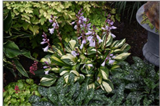
Rainbow's End Hosta in bloom

Rainbow's End Hosta is recommended for the following landscape applications;