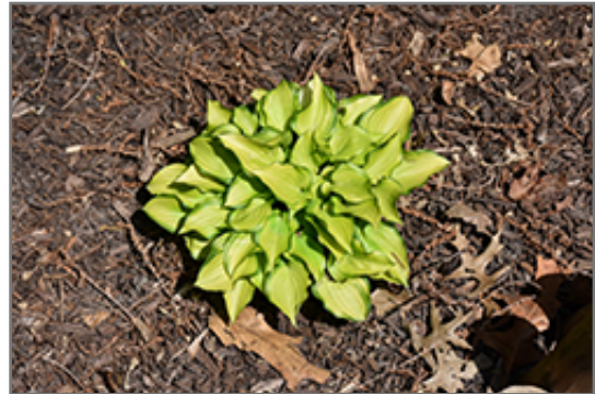
Cracker Crumbs Hosta

Cracker Crumbs Hosta is recommended for the following landscape applications;