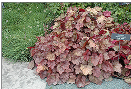
Georgia Peach Coral Bells

Georgia Peach Coral Bells is recommended for the following landscape applications;