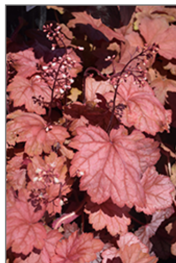
Georgia Peach Coral Bells in bloom