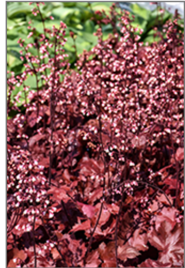
Fire Chief Coral Bells flowers

Fire Chief Coral Bells is recommended for the following landscape applications;