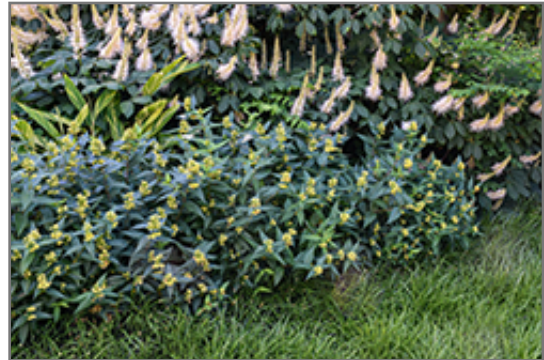
Butterfly Southern Bush Honeysuckle flowers

This plant is not reliably hardy in our region, and certain restrictions may apply; contact the store for more information.