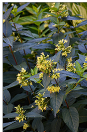
Butterfly Southern Bush Honeysuckle flowers