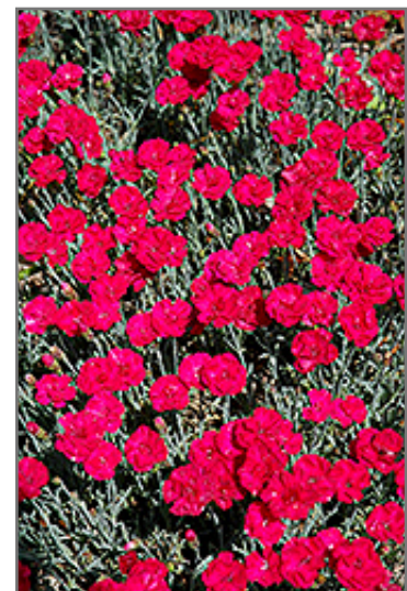
Frosty Fire Pinks flowers