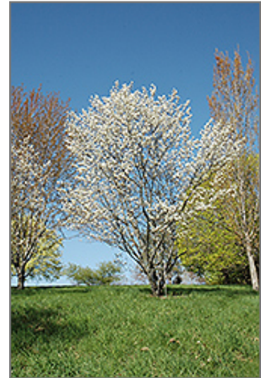
Princess Diana Serviceberry in bloom