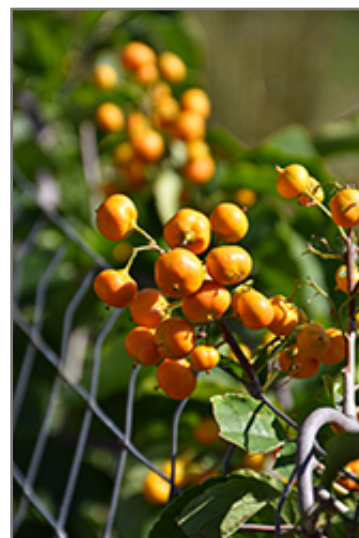
Autumn Revolution American Bittersweet fruit