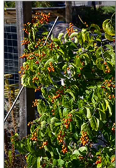
Autumn Revolution American Bittersweet fruit

This woody vine should only be grown in full sunlight. It is very adaptable to both dry and moist locations, and should do just fine under average home landscape conditions. It is considered to be drought-tolerant, and thus makes an ideal choice for xeriscaping or the moisture-conserving landscape. It is not particular as to soil type or pH, and is able to handle environmental salt. It is highly tolerant of urban pollution and will even thrive in inner city environments. This is a selection of a native North American species.