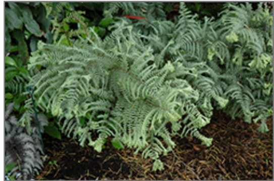
Ocean's Fury Painted Fern

This plant is not reliably hardy in our region, and certain restrictions may apply; contact the store for more information.