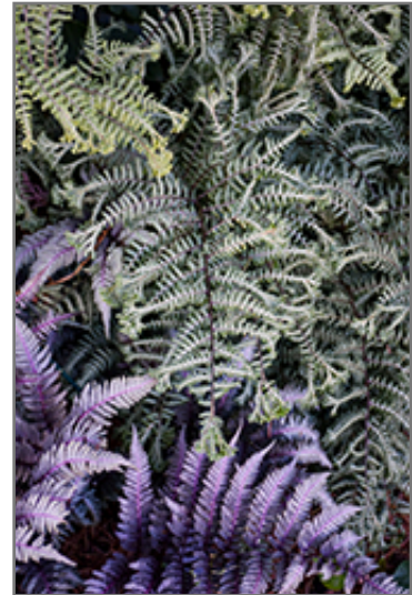
Ocean's Fury Painted Fern foliage