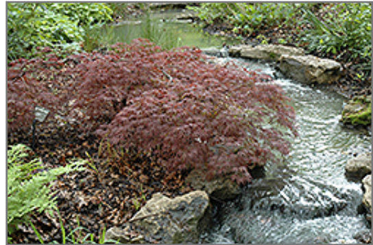
Inaba Shidare Cutleaf Japanese Maple

Inaba Shidare Cutleaf Japanese Maple will grow to be about 8 feet tall at maturity, with a spread of 8 feet. It tends to be a little leggy, with a typical clearance of 2 feet from the ground, and is suitable for planting under power lines. It grows at a medium rate, and under ideal conditions can be expected to live for 60 years or more.