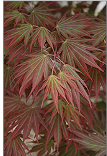
Johin Full Moon Japanese Maple foliage