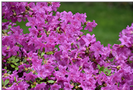
Karen Azalea flowers

Karen Azalea will grow to be about 4 feet tall at maturity, with a spread of 4 feet. It tends to be a little leggy, with a typical clearance of 1 foot from the ground. It grows at a slow rate, and under ideal conditions can be expected to live for 40 years or more.