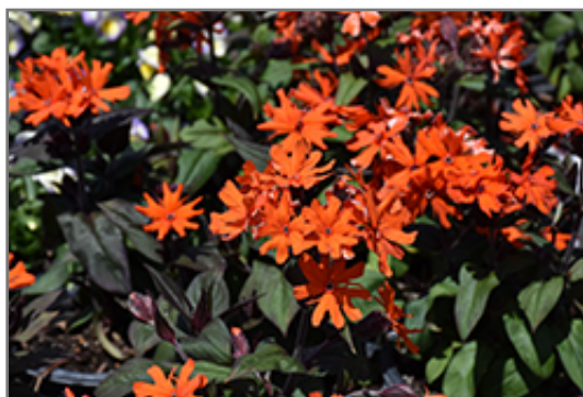
Orange Gnome Campion flowers