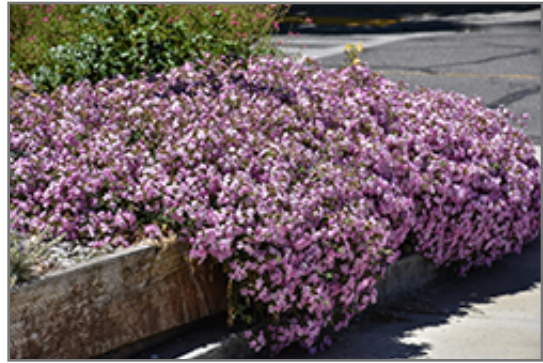
Max Frei Soapwort in bloom

Max Frei Soapwort will grow to be about 8 inches tall at maturity extending to 12 inches tall with the flowers, with a spread of 12 inches. When grown in masses or used as a bedding plant, individual plants should be spaced approximately 10 inches apart. It grows at a medium rate, and under ideal conditions can be expected to live for approximately 10 years. As an evergreen perennial, this plant will typically keep its form and foliage year-round.