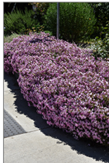
Max Frei Soapwort in bloom

Max Frei Soapwort is recommended for the following landscape applications;