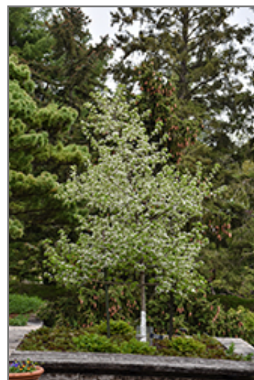
Korean Sun Pear in bloom