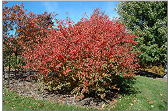
Korean Sun Pear in fall

This plant is not reliably hardy in our region, and certain restrictions may apply; contact the store for more information.