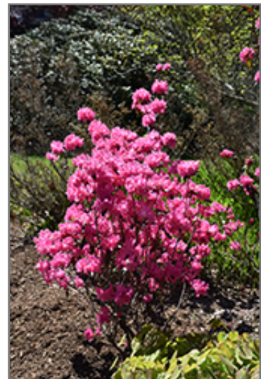
Landmark Rhododendron in bloom