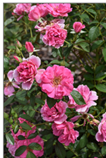
Ruffled Cloud Rose flowers