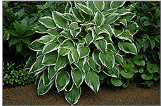
So Sweet Hosta

So Sweet Hosta will grow to be about 12 inches tall at maturity extending to 18 inches tall with the flowers, with a spread of 12 inches. When grown in masses or used as a bedding plant, individual plants should be spaced approximately 10 inches apart. Its foliage tends to remain dense right to the ground, not requiring facer plants in front. It grows at a medium rate, and under ideal conditions can be expected to live for approximately 10 years. As an herbaceous perennial, this plant will usually die back to the crown each winter, and will regrow from the base each spring. Be careful not to disturb the crown in late winter when it may not be readily seen!