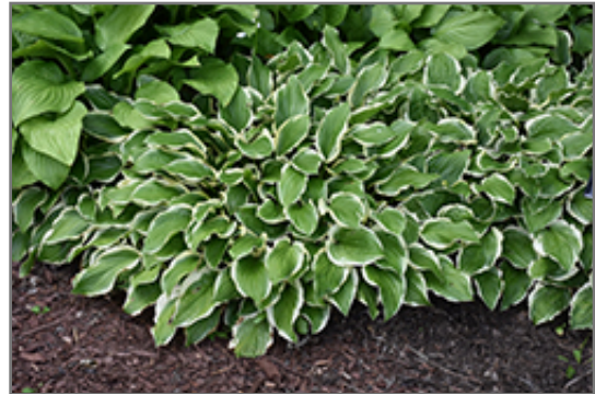
So Sweet Hosta

So Sweet Hosta is recommended for the following landscape applications;