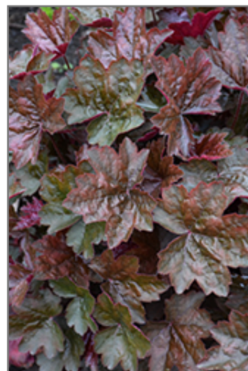
Rachel Coral Bells foliage