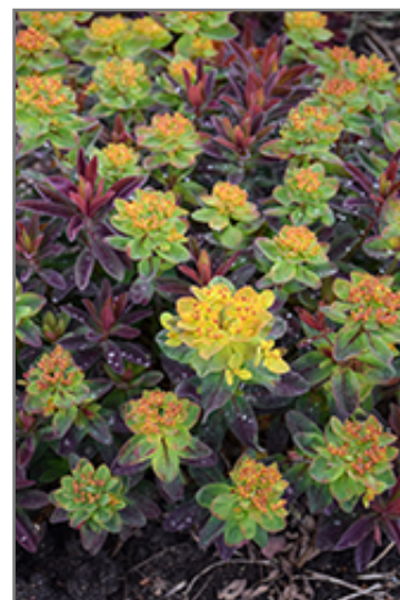
Bonfire Cushion Spurge flowers

Bonfire Cushion Spurge is recommended for the following landscape applications;