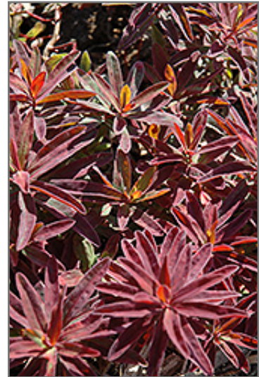
Bonfire Cushion Spurge foliage

This plant is not reliably hardy in our region, and certain restrictions may apply; contact the store for more information.