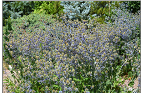
Blue Cap Sea Holly in bloom

Blue Cap Sea Holly will grow to be about 24 inches tall at maturity extending to 3 feet tall with the flowers, with a spread of 18 inches. When grown in masses or used as a bedding plant, individual plants should be spaced approximately 15 inches apart. It tends to be leggy, with a typical clearance of 1 foot from the ground, and should be underplanted with lower-growing perennials. It grows at a fast rate, and under ideal conditions can be expected to live for approximately 10 years. As an herbaceous perennial, this plant will usually die back to the crown each winter, and will regrow from the base each spring. Be careful not to disturb the crown in late winter when it may not be readily seen!