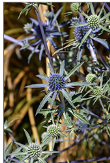
Blue Cap Sea Holly flowers