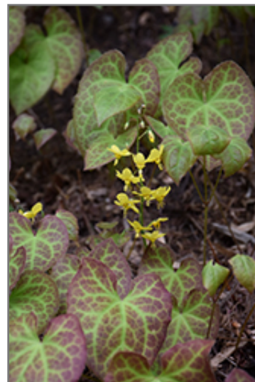
Froehnleiten Bishop's Hat flowers

This plant is not reliably hardy in our region, and certain restrictions may apply; contact the store for more information.