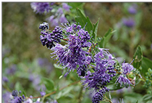
Blue Mist Caryopteris flowers

Blue Mist Caryopteris is recommended for the following landscape applications;