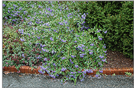
Blue Mist Caryopteris in bloom

Blue Mist Caryopteris will grow to be about 3 feet tall at maturity, with a spread of 3 feet. It tends to fill out right to the ground and therefore doesn't necessarily require facer plants in front. It grows at a medium rate, and under ideal conditions can be expected to live for approximately 20 years.