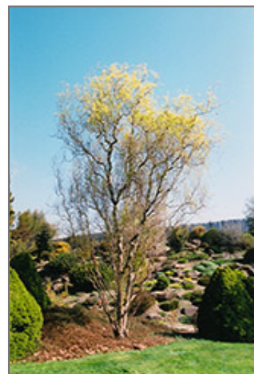
Dragon's Claw Willow in winter

Dragon's Claw Willow will grow to be about 30 feet tall at maturity, with a spread of 25 feet. It has a low canopy with a typical clearance of 2 feet from the ground, and should not be planted underneath power lines. It grows at a fast rate, and under ideal conditions can be expected to live for 40 years or more.