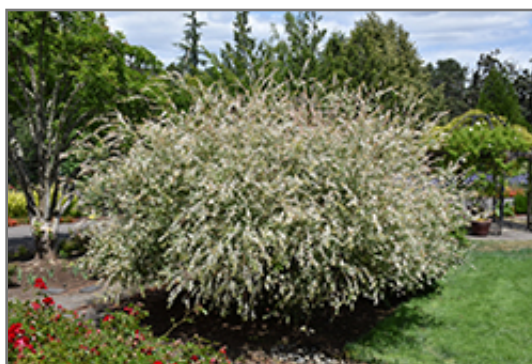
Tricolor Willow