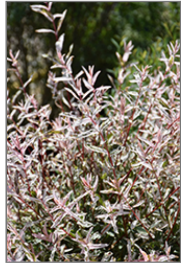
Tricolor Willow foliage

This plant is not reliably hardy in our region, and certain restrictions may apply; contact the store for more information.