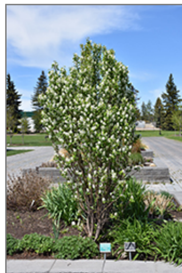
Standing Ovation Saskatoon Berry in bloom