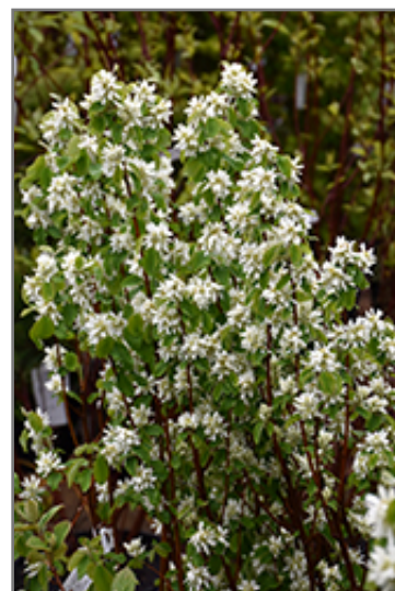
Standing Ovation Saskatoon Berry flowers