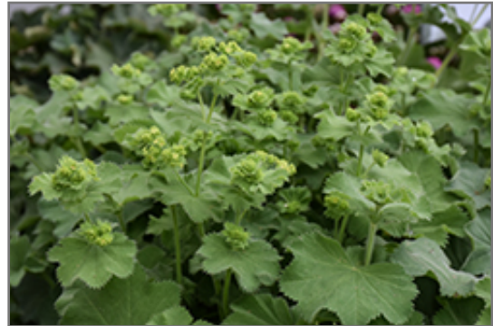
Auslese Lady's Mantle flowers

Auslese Lady's Mantle will grow to be about 18 inches tall at maturity extending to 24 inches tall with the flowers, with a spread of 3 feet. Its foliage tends to remain dense right to the ground, not requiring facer plants in front. It grows at a medium rate, and under ideal conditions can be expected to live for approximately 10 years. As an herbaceous perennial, this plant will usually die back to the crown each winter, and will regrow from the base each spring. Be careful not to disturb the crown in late winter when it may not be readily seen!