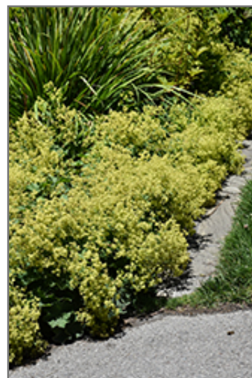
Auslese Lady's Mantle in bloom

Auslese Lady's Mantle is recommended for the following landscape applications;