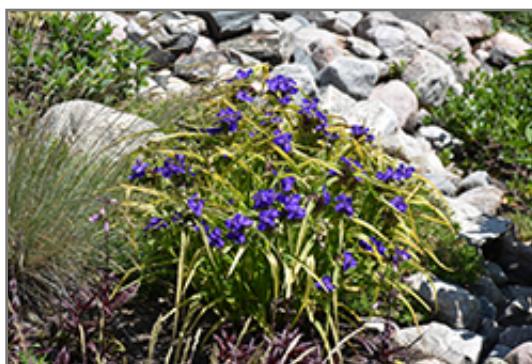
Blue And Gold Spiderwort in bloom