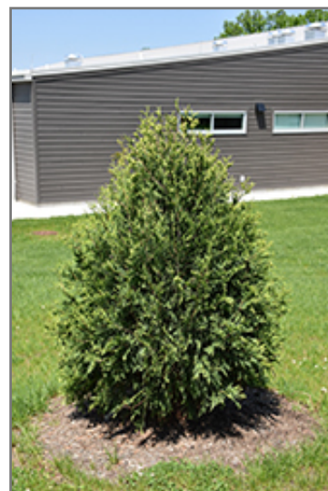
Technito Arborvitae