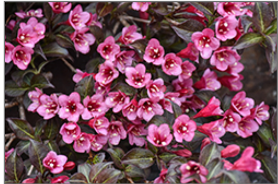
Sonic Bloom Wine Reblooming Weigela flowers

Sonic Bloom Wine Reblooming Weigela is recommended for the following landscape applications;