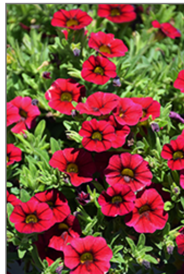
Callie Dark Red Calibrachoa flowers

Callie Dark Red Calibrachoa is recommended for the following landscape applications;