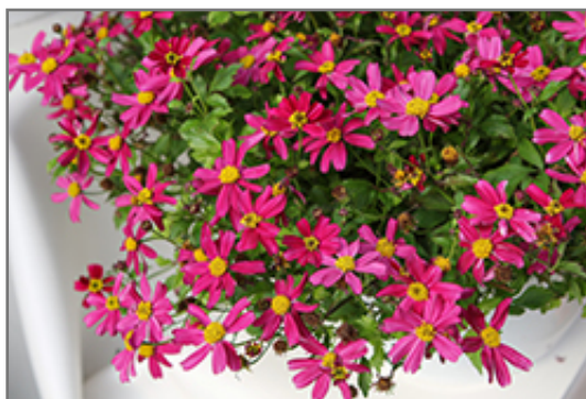
Bee Pink Buzz Bidens flowers