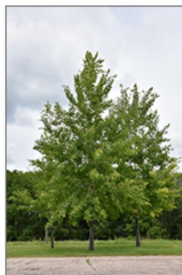
Summer Shimmer Aspen