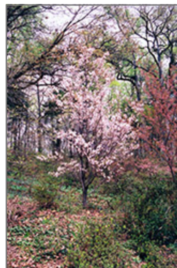
Wase-Miyako Flowering Cherry in bloom