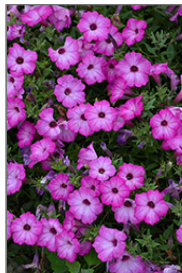
Supertunia Tiara Pink Petunia flowers

Supertunia Tiara Pink Petunia is recommended for the following landscape applications;