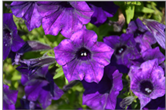
Supertunia Mini Vista Ultramarine Petunia flowers

This plant will require occasional maintenance and upkeep. Trim off the flower heads after they fade and die to encourage more blooms late into the season. It is a good choice for attracting butterflies and hummingbirds to your yard, but is not particularly attractive to deer who tend to leave it alone in favor of tastier treats. It has no significant negative characteristics.