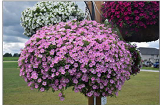
Itsy Pink Petunia in bloom

Itsy Pink Petunia is a fine choice for the garden, but it is also a good selection for planting in outdoor containers and hanging baskets. Because of its trailing habit of growth, it is ideally suited for use as a 'spiller' in the 'spiller-thriller-filler' container combination; plant it near the edges where it can spill gracefully over the pot. Note that when growing plants in outdoor containers and baskets, they may require more frequent waterings than they would in the yard or garden.