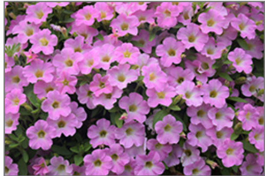
Itsy Pink Petunia flowers

This plant will require occasional maintenance and upkeep. Trim off the flower heads after they fade and die to encourage more blooms late into the season. It is a good choice for attracting bees, butterflies and hummingbirds to your yard, but is not particularly attractive to deer who tend to leave it alone in favor of tastier treats. It has no significant negative characteristics.