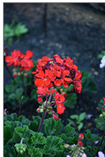
Savannah Bright Red Geranium flowers

Savannah Bright Red Geranium is recommended for the following landscape applications;