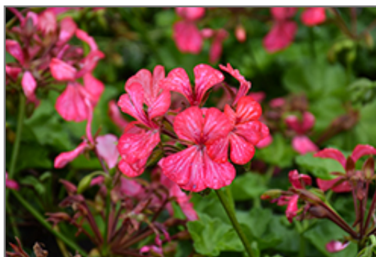
Glory Days Pink Bicolor Geranium flowers

Glory Days Pink Bicolor Geranium is recommended for the following landscape applications;