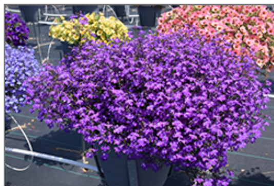
Techno Large Blue Violet Lobelia in bloom