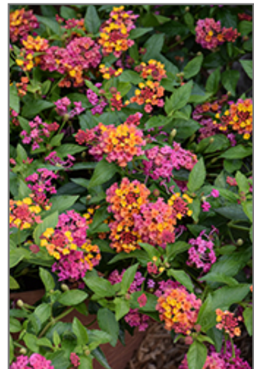
PassionFruit Lantana flowers