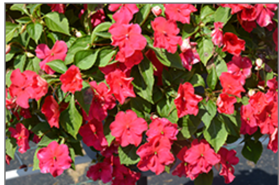
Beacon Lipstick Impatiens flowers