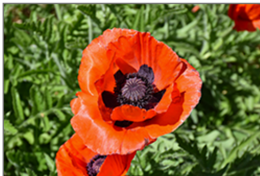
Crimson Red Poppy flowers

Crimson Red Poppy is recommended for the following landscape applications;