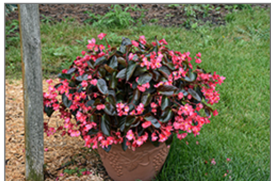
Dragon Wing Pink Bronze Leaf Begonia in bloom