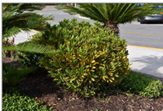
Gold Dust Variegated Croton