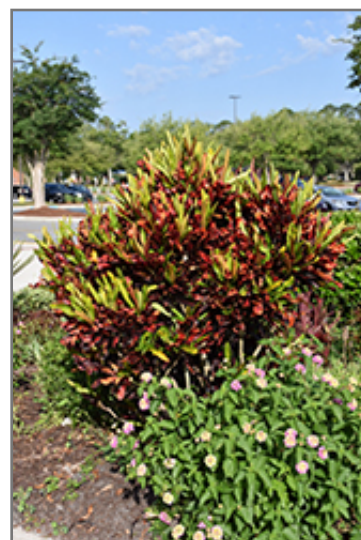
Mammy Croton