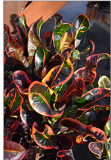
Mammy Croton foliage

-- THIS IS A TROPICAL PLANT AND SHOULD NOT BE EXPECTED TO SURVIVE THE WINTER OUTDOORS IN OUR CLIMATE --