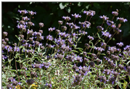
Winnifred Gilman Sage flowers