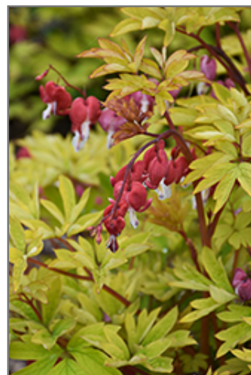
Ruby Gold Bleeding Heart flowers

Ruby Gold Bleeding Heart is recommended for the following landscape applications;