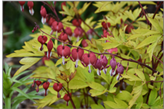
Ruby Gold Bleeding Heart flowers

Ruby Gold Bleeding Heart will grow to be about 3 feet tall at maturity, with a spread of 3 feet. When grown in masses or used as a bedding plant, individual plants should be spaced approximately 30 inches apart. It grows at a medium rate, and under ideal conditions can be expected to live for approximately 15 years. As an herbaceous perennial, this plant will usually die back to the crown each winter, and will regrow from the base each spring. Be careful not to disturb the crown in late winter when it may not be readily seen! As this plant tends to go dormant in summer, it is best interplanted with late-season bloomers to hide the dying foliage.