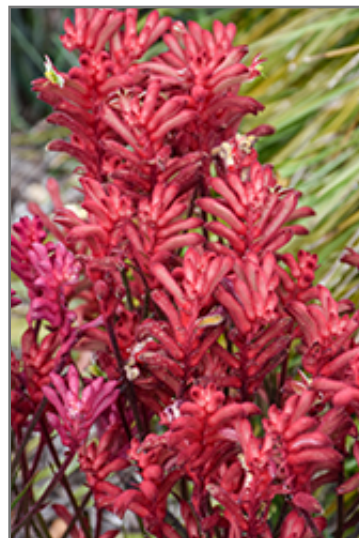
Bush Crystal Kangaroo Paw flowers