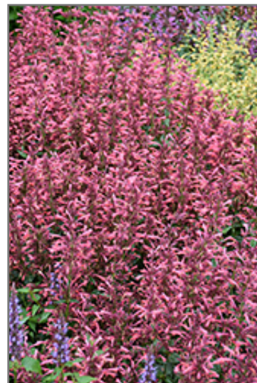
Summerlong Coral Hyssop flowers

Summerlong Coral Hyssop is recommended for the following landscape applications;